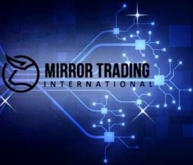
Member 40% Earning per Week